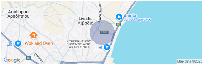
*Showing approximate location