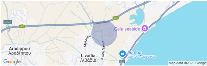
*Showing approximate location