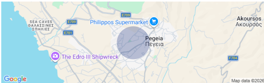
Showing approximate location