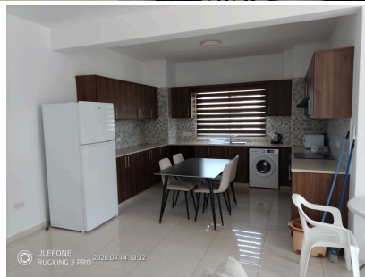
ULEFONE RUCKING 3 PRO 2026.04.14 13:32