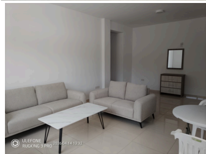
ULEFONE RUCKING 3 PRO 2026.04.14 13:32