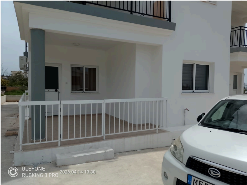
ULEFONE RUCKING 3 PRO 2026.04.14 13:30