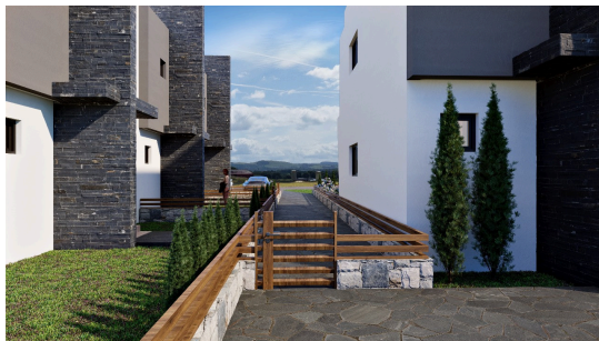
*Showing approximate location